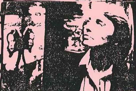
The pornographic mind Dr Paglia

THE MORE WE GET, THE BETTER QUEER WILL BE - SEND WORKS TO PO BOX 2127 SAC, CA 95812