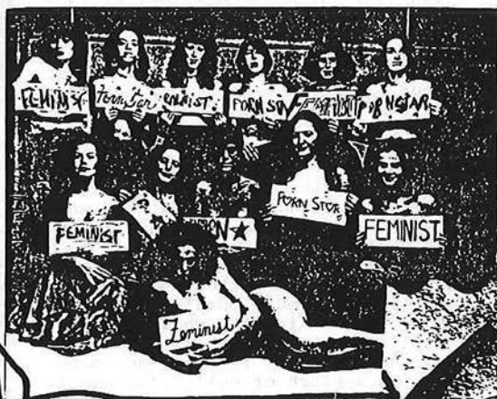
Fig. 1 Deep Inside Porn Stars by Club 90 and Carnival Knowledge