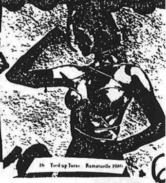
16 Tied up Torno Ramatuelle 1980