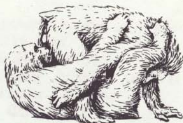
▲ Two male Stumptail Macaques in mutual fellatio

Your hands cupping, curling, pocketing, softening, ascending, descending, kneading, releasing, always moving, promising more.