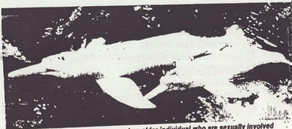
▲ Two male Botos, a younger and an older individual who are sexually involved with one another, swimming side by side while touching.