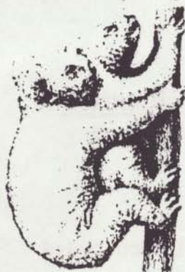
◀ A female Koula mounting another female