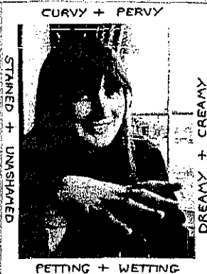
PETTING + WETTING