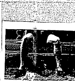
PISSING MY KNICKERS ON A PARK BENCH!