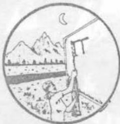
Back cover graphics by Earth First!

LOADS OF GOOD TIPS IN THIS LITTLE BOOKLET - YOU CAN GET IT FROM AK PRESS: 22, LUTTON PLACE, BRIMBOROUGH, LEICESTERSHIRE, LE19 1BP.