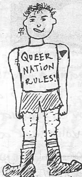
the clone inside me, screaming to be free (hee hee)